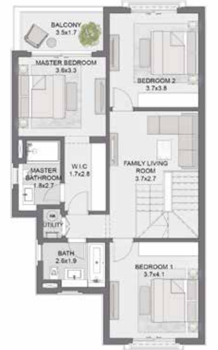
FIRST FLOOR LEVEL