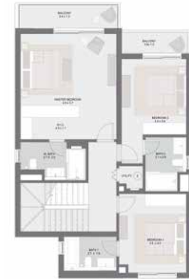
FIRST FLOOR LEVEL