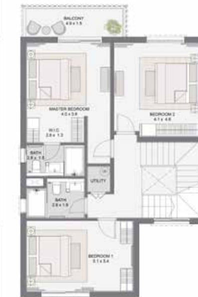
FIRST FLOOR LEVEL