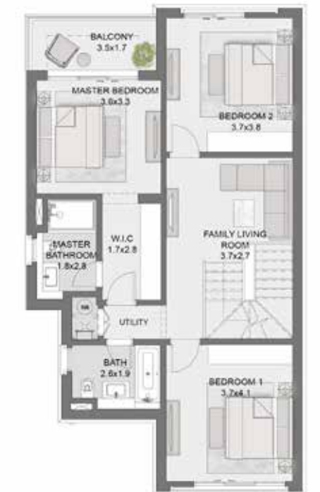
FIRST FLOOR LEVEL