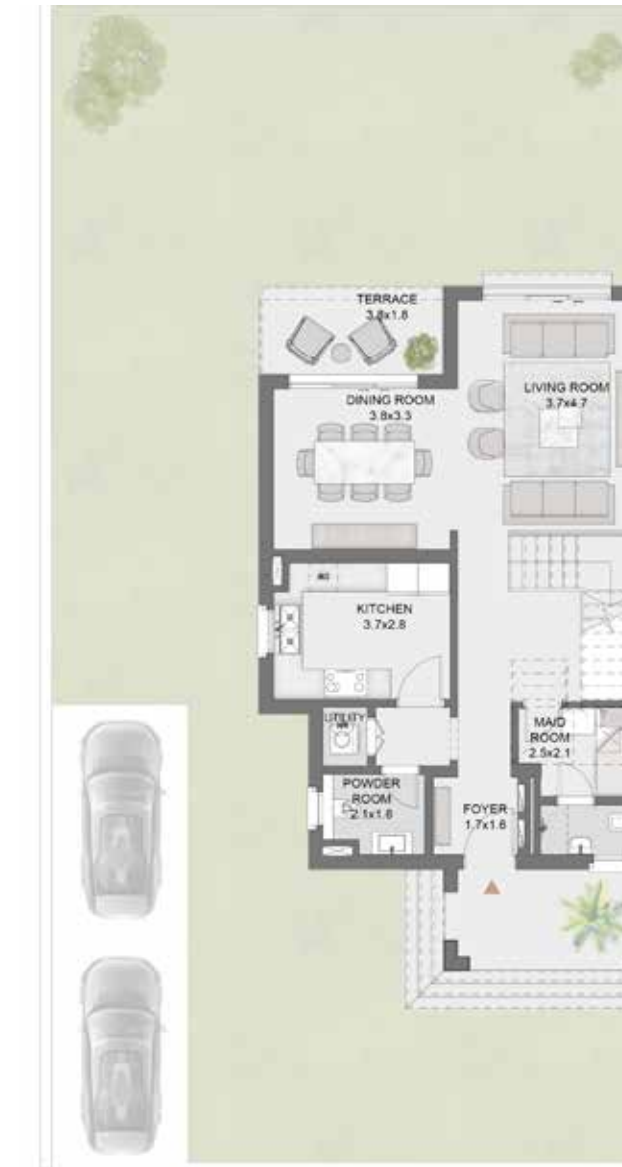
GROUND FLOOR LEVEL