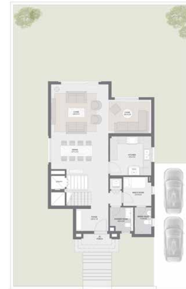
GROUND FLOOR LEVEL