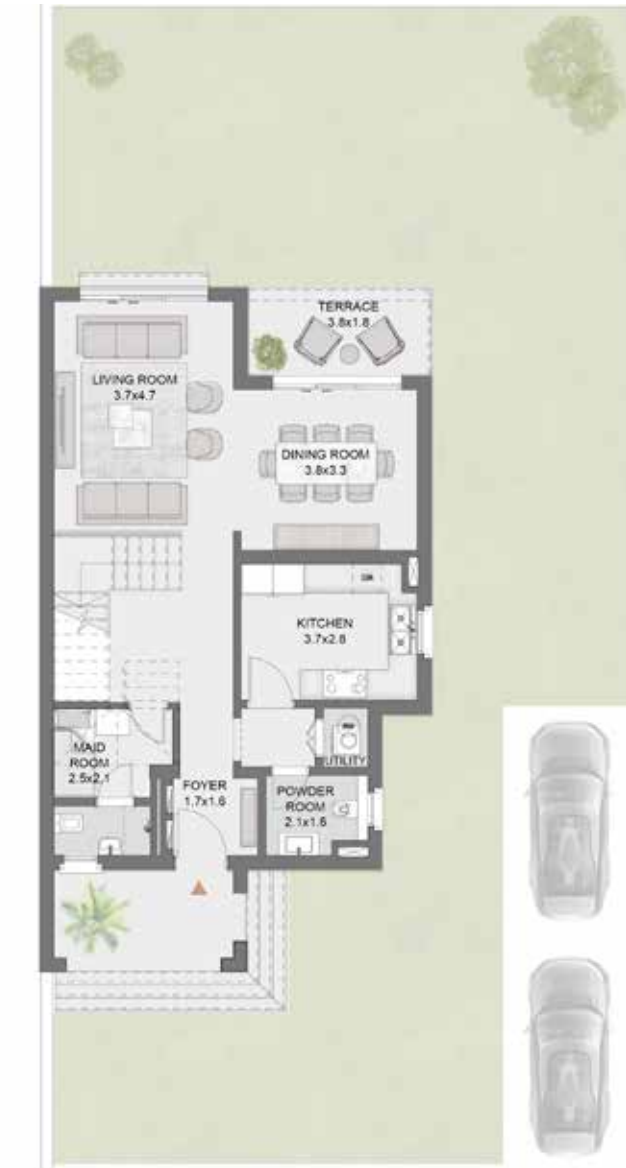
GROUND FLOOR LEVEL