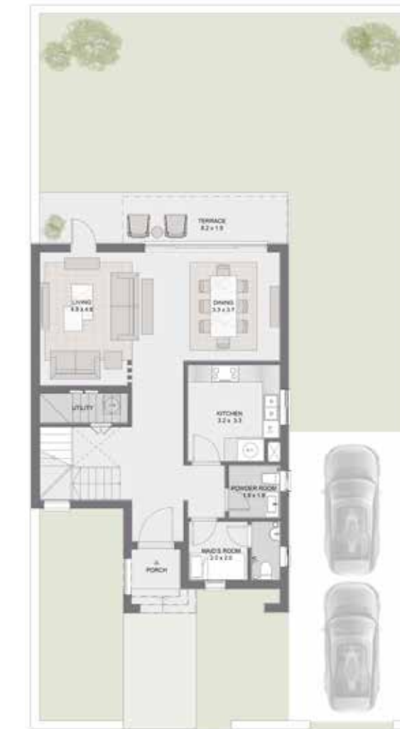
GROUND FLOOR LEVEL