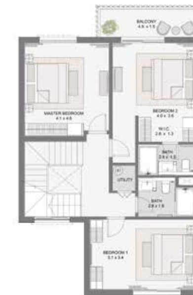
FIRST FLOOR LEVEL