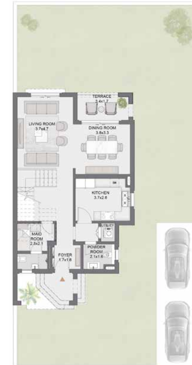
GROUND FLOOR LEVEL