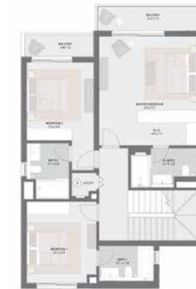
FIRST FLOOR LEVEL