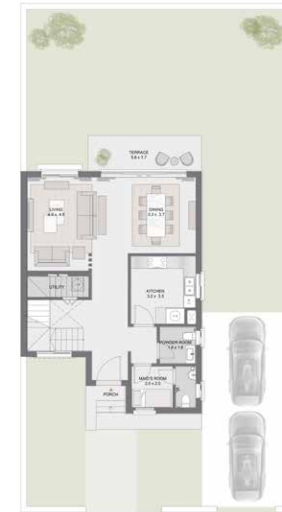
GROUND FLOOR LEVEL