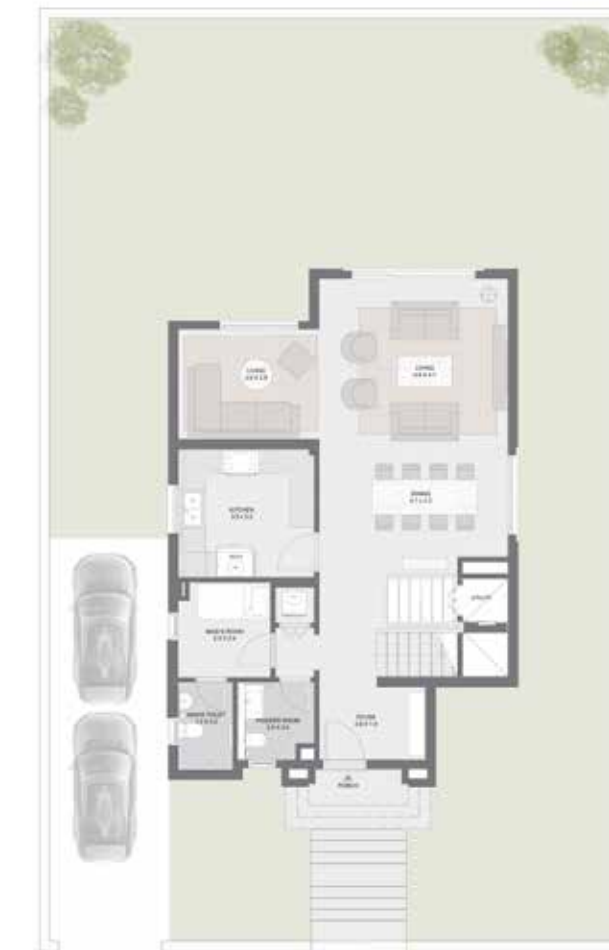
GROUND FLOOR LEVEL