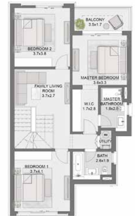
FIRST FLOOR LEVEL