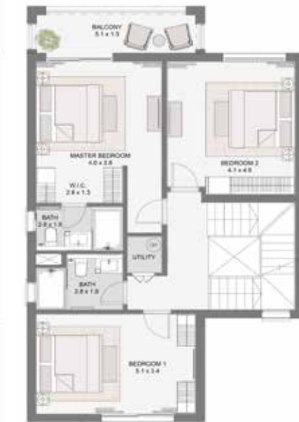
FIRST FLOOR LEVEL