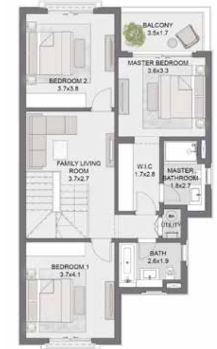
FIRST FLOOR LEVEL