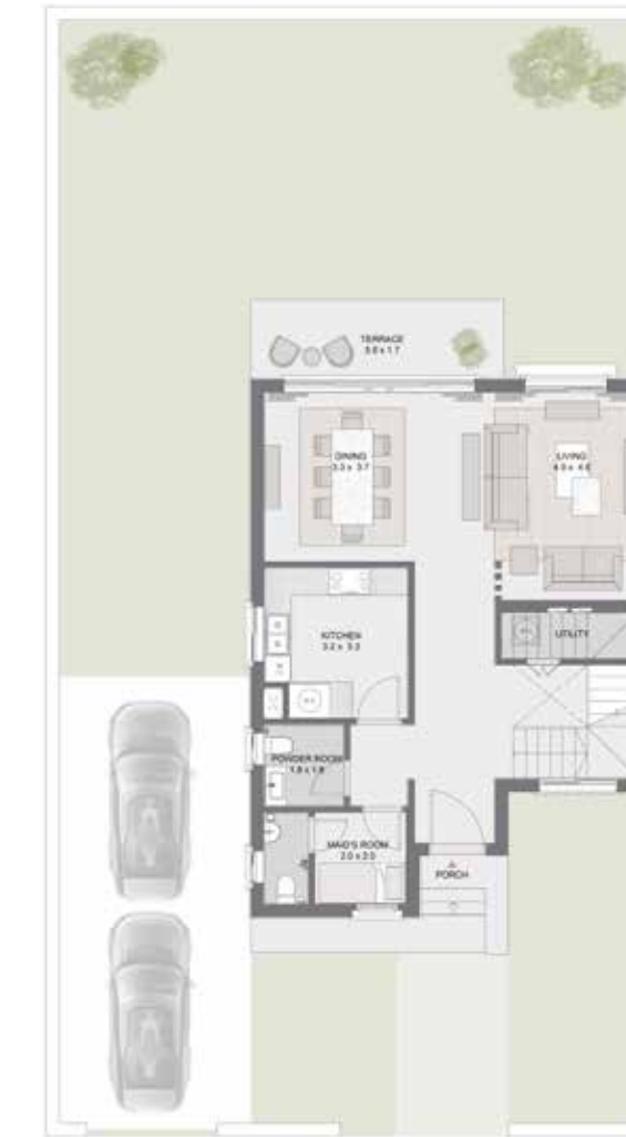
GROUND FLOOR LEVEL