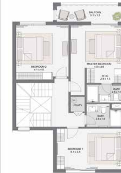
FIRST FLOOR LEVEL