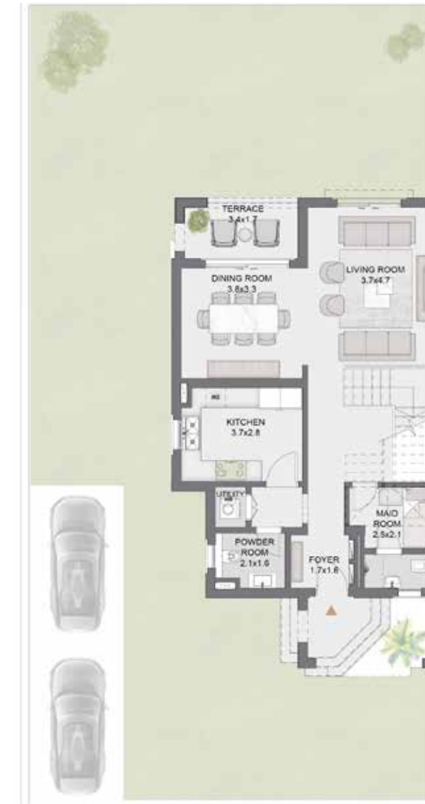
GROUND FLOOR LEVEL